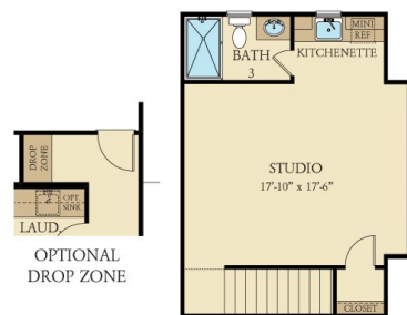
OPTIONAL STUDIO AND BATH OVER GARAGE