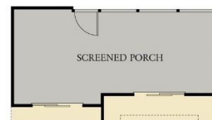
OPTIONAL SCREENED PORCH