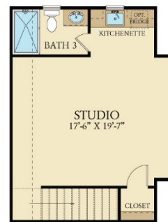
OPTIONAL STUDIO AND BATH OVER GARAGE